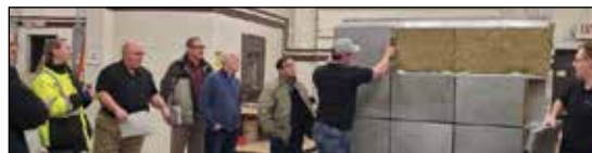
Cosentino Tile demonstrating their porcelain rainscreen system. Panels and the mock up was custom built for this event.