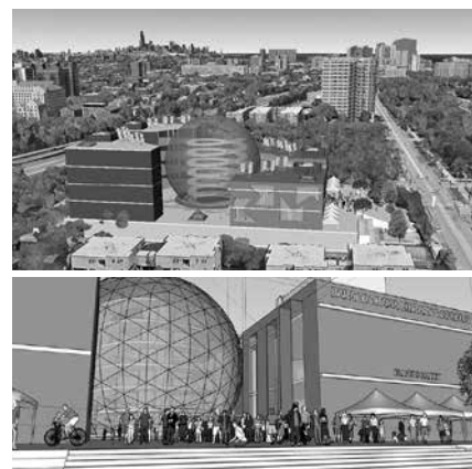
ACE Obama Library Design