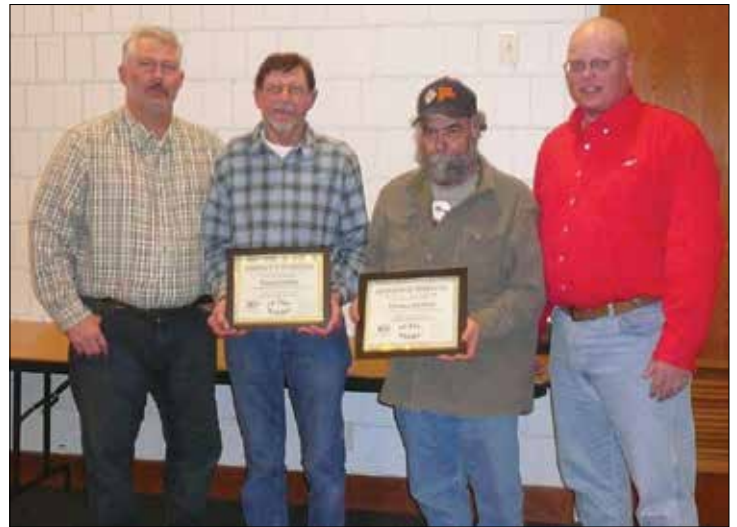
St. Cloud, MN: Members Gold Card Dinner at St. Cloud Eagles Club on April 1, 2017