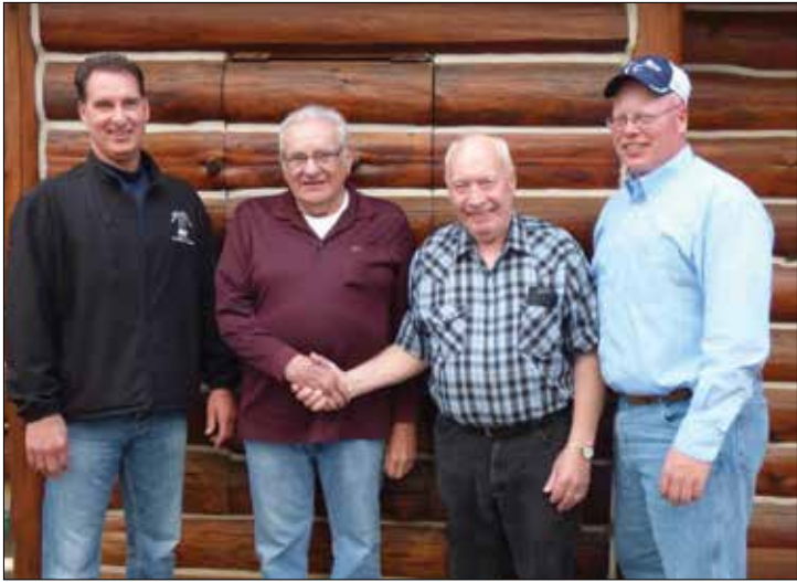
Nevis, MN: 50-Year Members Gold Card Dinner at Bullwinkles on April 22, 2017