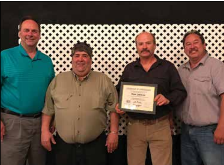
Mankato, MN: 40-Year Member Gold Card Dinner at Eagles Club on April 21, 2017