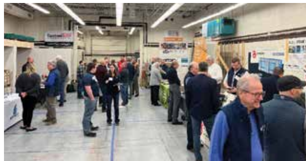
BEC-CSI-IMI event at training center